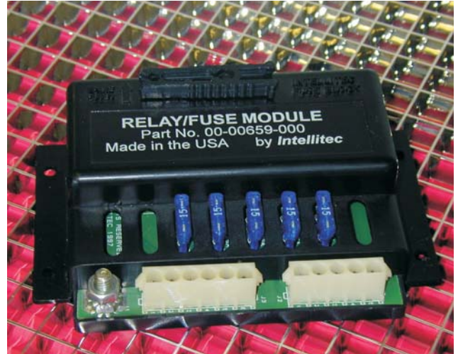
Part Number 00-00659-000

The relays used are rugged, automotive rated units that will provide long life under heavy use.