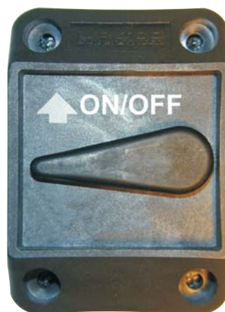
Part Number: 00-00754-000 Actual Size: 3.55" H X 2.5" W

The Cargo Light Control/E is activated by a momentary switch connected to ground. Intellitec offers a companion switch ( below ) to activate this control. This weather tight switch can be used in applications where washing down the interior of the truck is routinely performed.