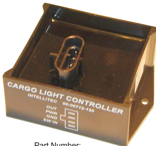
Part Number: 00-00712-120 (12V) 00-00712-240 (24V)

The Cargo Light Control/E is a water proof module, suitable for harsh environments. The electrical connections are made with a Packard Weather pack connector.